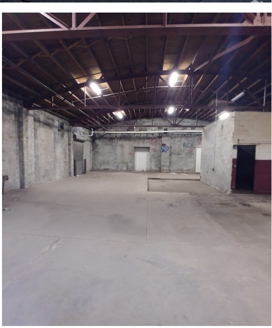
KW COMMERCIAL 11269 Perry Highway Wexford, PÁ 15090